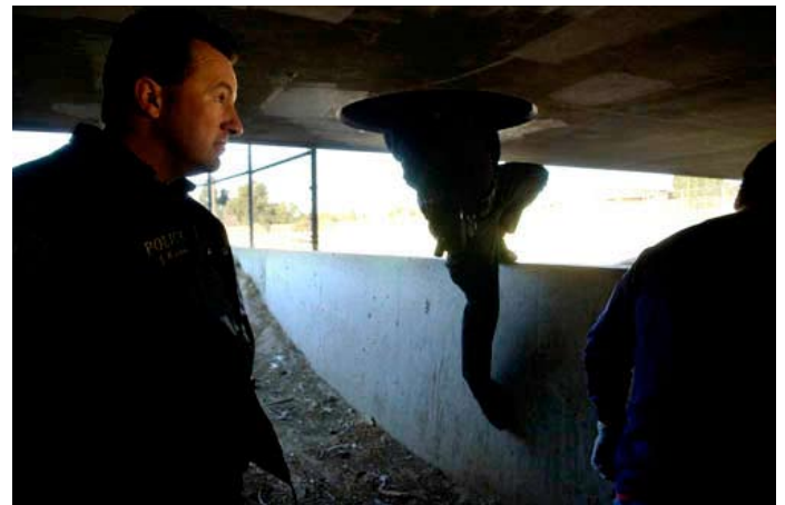
Karen Quincy Loberg / Star Staff

Online: Log on to www.VenturaCountyStar.com for an interactive version of this map.